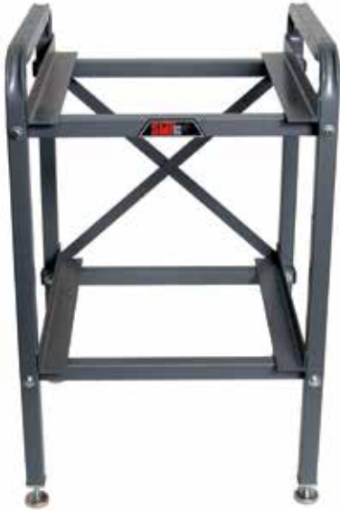
300-1699 2 Tier