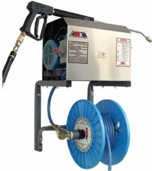
Includes hose reel