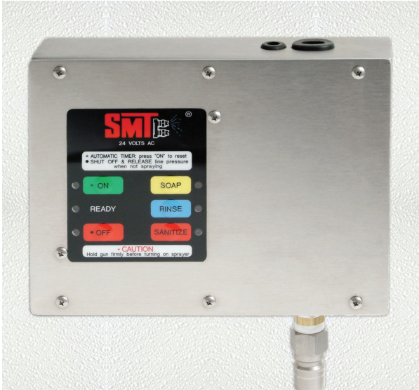
300-1698: Surface Mount