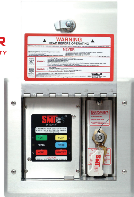
300-5214: Recessed Retro-Fit

Remotes are supplied with high pressure via a high pressure drop hose or can be plumbed with stainless steel tubing. They are the key component of the SMT Central System.