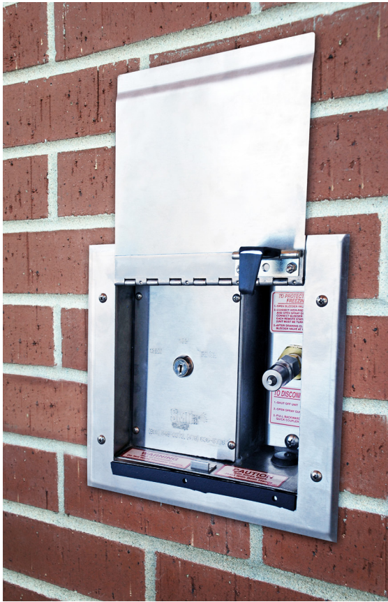
300-5202: New Masonry Construction