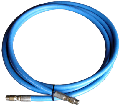
Multiple SKU's - please see Weights